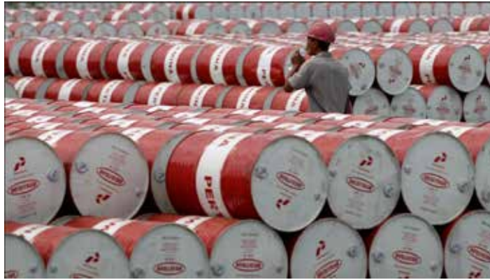
The Willow Project proposes the extraction of 600 million oil barrels over 30 years.

Such a project calls for the creation of three dedicated drilling sites, two less than the five ConocoPhillips had originally proposed. To build them, 2,500 construction workers will be