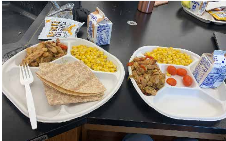
Average NYCDOE student lunch

A controversial topic: beans. In a real-world context, nearly 46,466,000 people chow down on a half cup of beans every day, according to the US Department of Agriculture. Beans are a life force; in the countries with the longest living lifespans, people eat a cup of the little nuggets a day. Thus, humanity needs to consume beans to preserve our time on this planet and to sustain our daily nutritional needs. If this is the