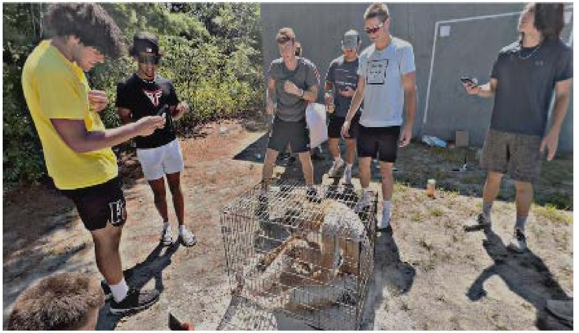
The cage punishment