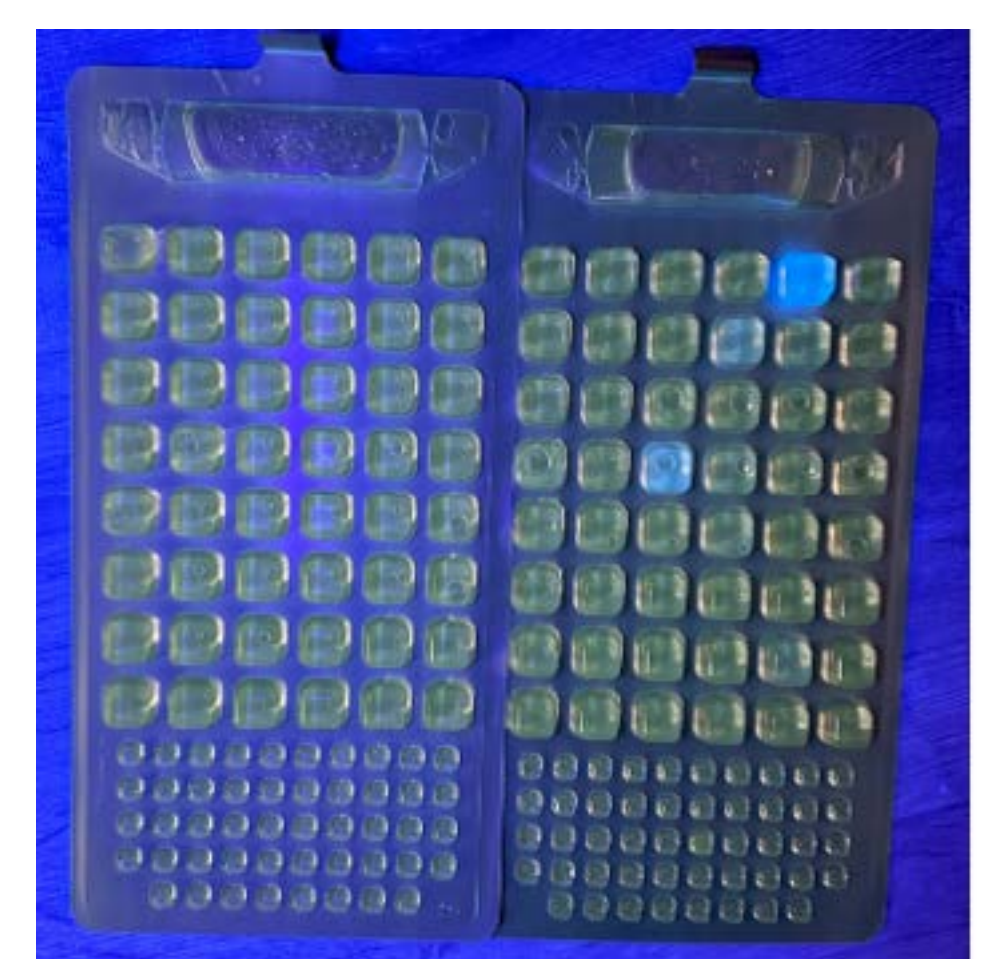
Side-by-side comparison of before vs. after testing

beaches closed due to faulty water quality that exceeded safety concerns; this was concerning as this was an increase of 94 closures from 2021. Many contributing factors to these unsafe cleanliness of water is due to rainfall, as it increases pollution that streams into oceans and sewage overflow. Rockaway in particular is vulnerable to such contamination risks due to its close proximity to sewage sources. According to THE CITY, "CFU refers to 'colony forming units,' a measure of the number of active bacteria in the water." The more people swimming and surfing in contaminated water increases the risk of them getting sick, which is why volunteer services are held to try and reduce waste in oceans and beaches; especially in such a populated place