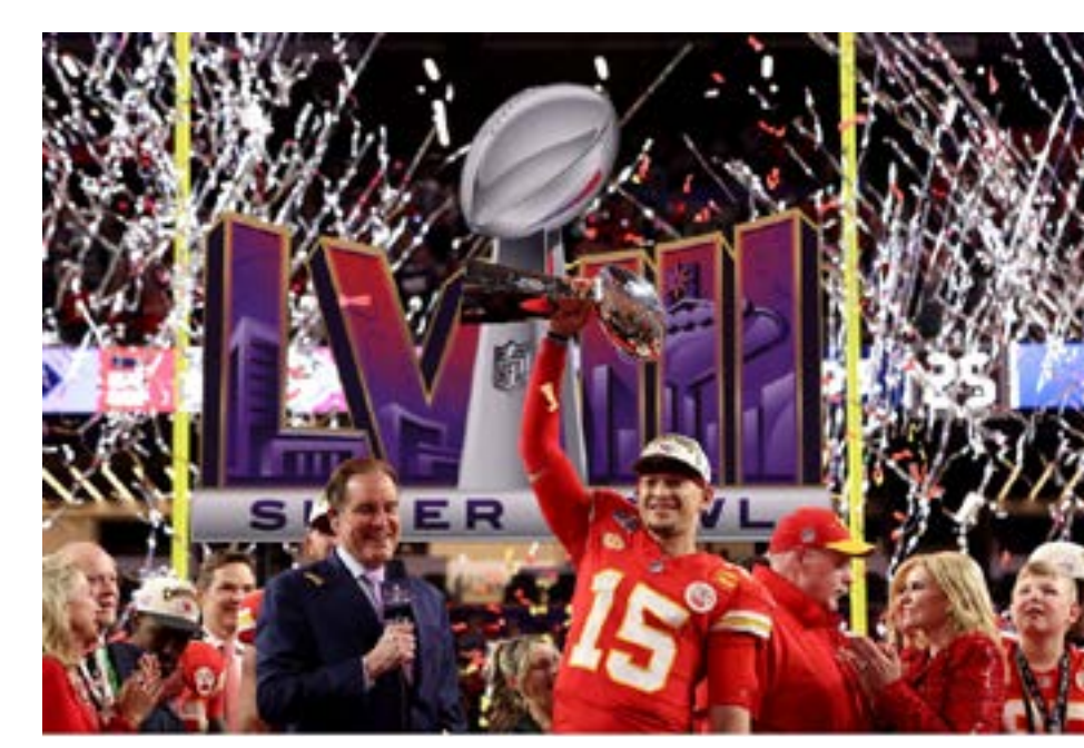
Photo Credit: axios.com // The Clinton Post Staff The Chiefs topped the 49ers 25-22 in an overtime thriller during Superbowl LVIII.

The game started out slow, but the 49ers were able to jump to a 10-point lead. Initially, it appeared that the 49ers would be able to run the ball consistently over