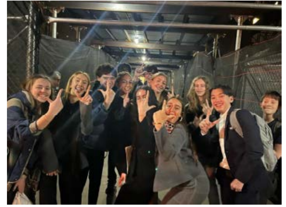
Members of the Mock Trial team after their recent loss.

Recently, the Clinton Mock Trial Club had their first meet where they ventured out to an official courthouse at 100 Centre street in manhattan. and competed with another school's mock trial team. Our beloved Clintonians went up against Salanter Yeshiva, Akiba Hebrew Academy, and the Riverdale Hebrew Day School (SAR Academy). The trial ended as a tie but Clinton unfortunately lost on the judge's ruling. Although they suffered an unfortunate loss, Clin-